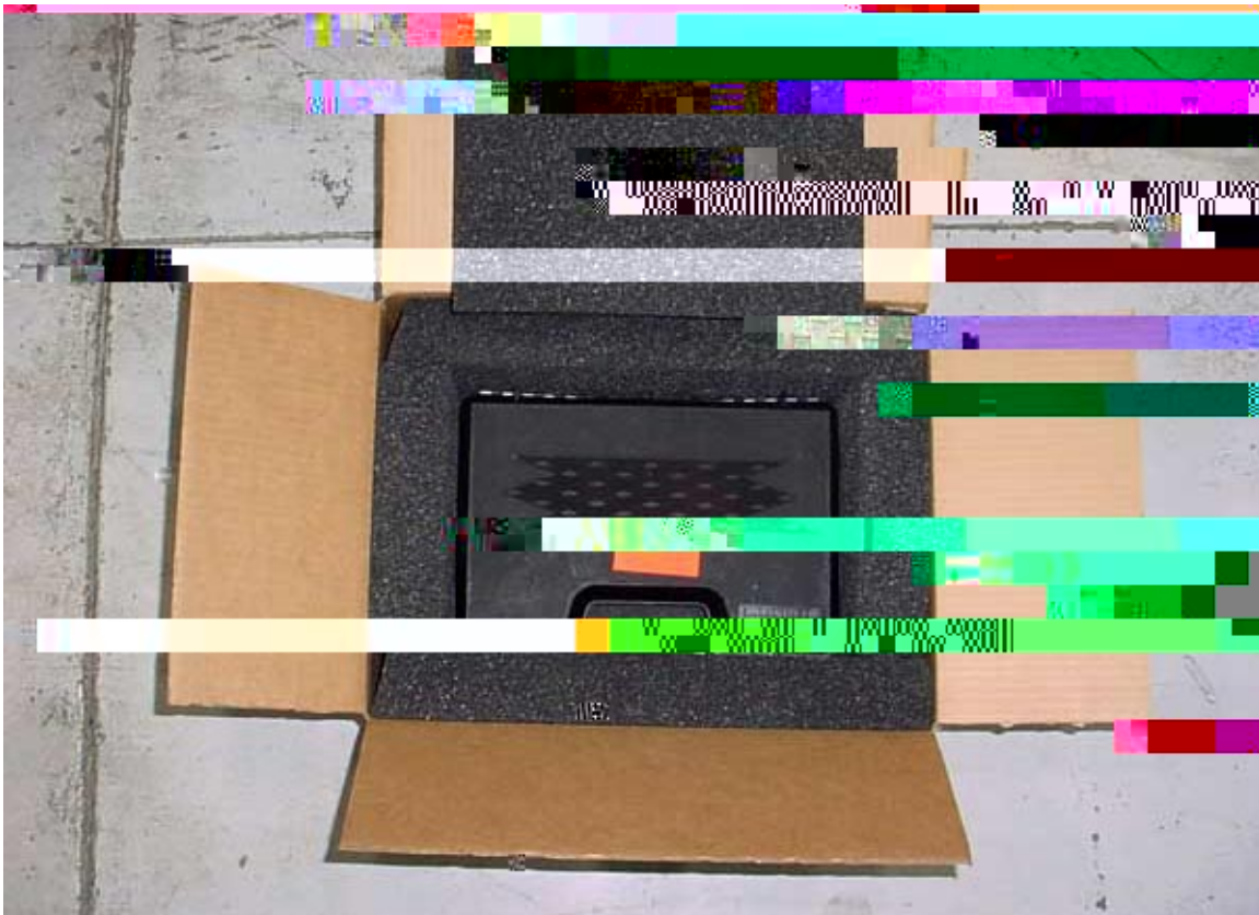
Figure 1. Delicate Product/Equipment – Fiberboard Box Overpack