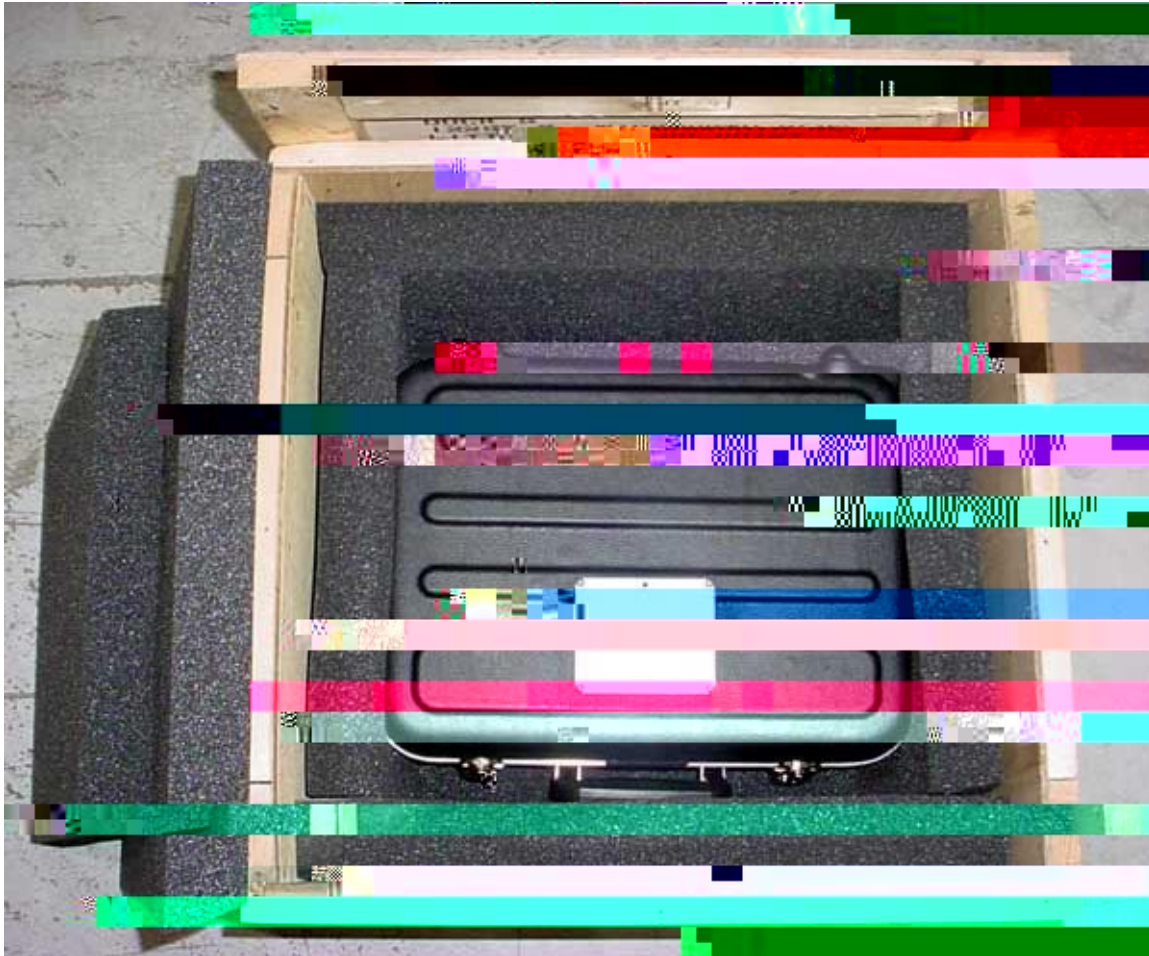
Figure 2. Delicate Product/Equipment – Wood Box Overpack