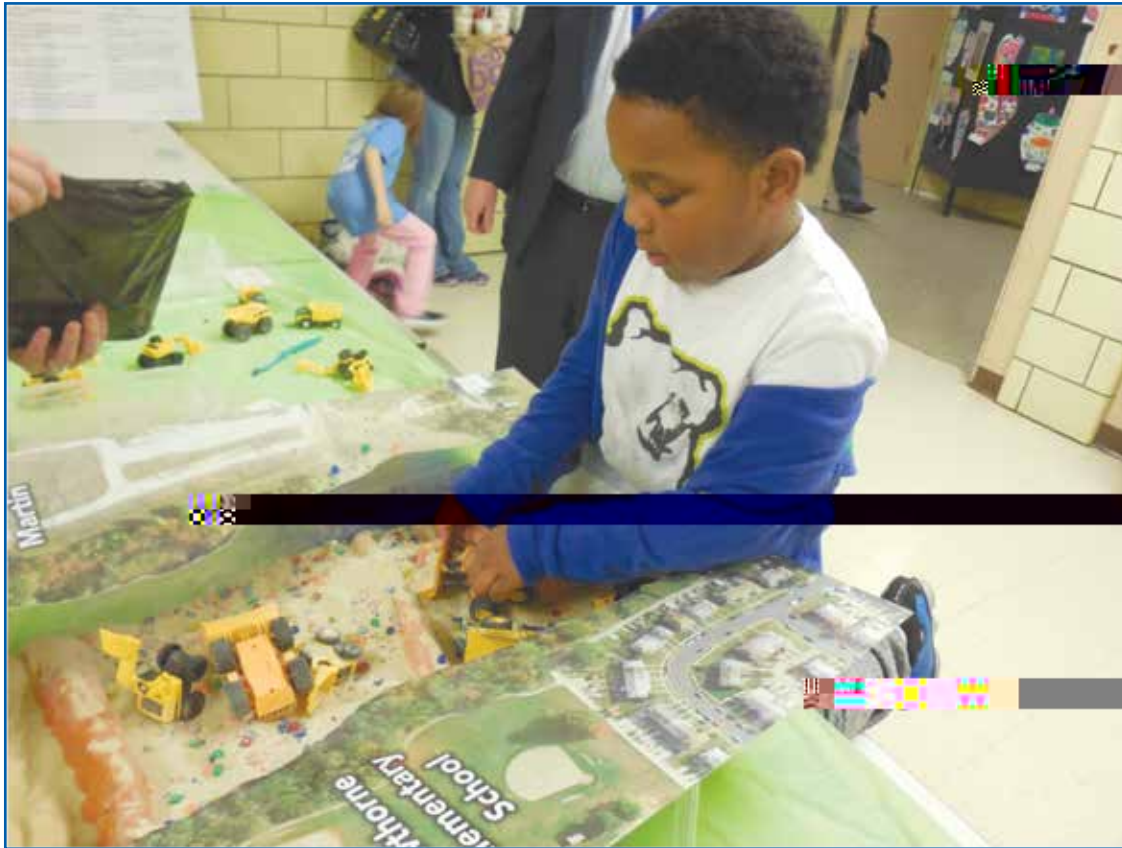
Children enjoyed creating work models of the upcoming sediment project.