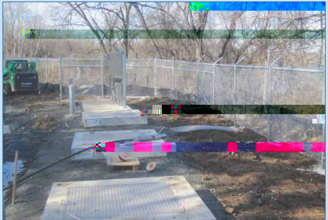
Fencing surrounds the site, including extraction wells, and includes a locked gate allowing access to the outfall pipe on Frog Mortar Creek.