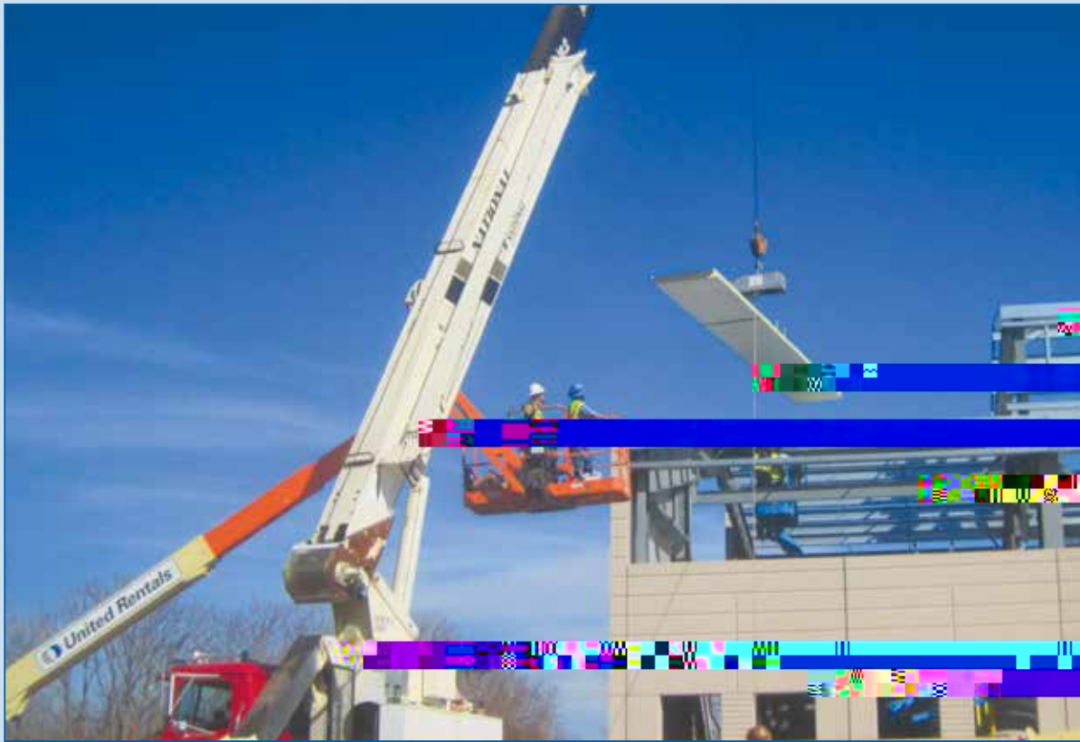
Roof panels were placed after the concrete walls were raised. The building should be watertight by the end of April.

issued an occupancy permit, operational testing will begin. The system will be tested initially using clean water from the water main. This phase of testing will check for leaks and make sure that pumps and control systems operate as designed. Following successful completion of these tests,