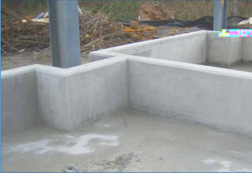
A hardener and sealant were applied to finish concrete floors and containment walls.