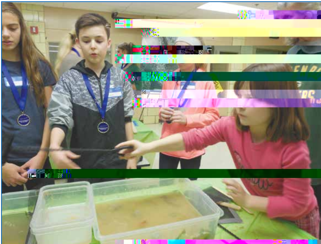
Middle school students challenge an elementary student to net all the fish within the allotted time.

The other two hands-on activity stations were developed by the Lockheed Martin team and showed the excavation and the creek restoration that will follow. Elementary students were eager to participate. Their parents said they had read in Lockheed Martin's newsletters about the upcoming work, and that the STEAM activities really helped explain the process they would see.