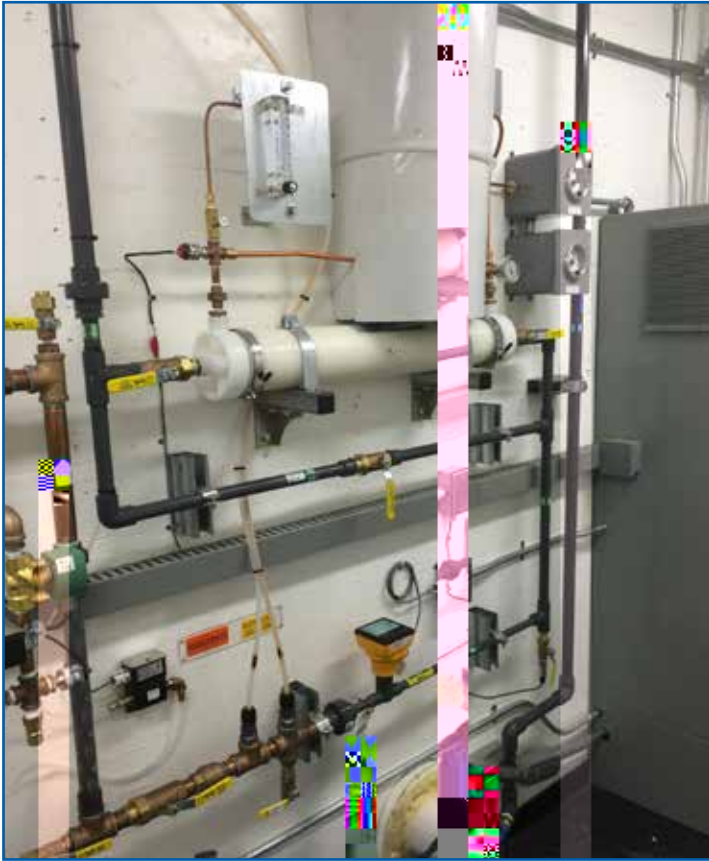
Groundwater injection system components.

As part of construction of the groundwater treatment system, Lockheed Martin removed more than 3,000 cubic yards (about 200 truckloads) of contaminated soil and hauled it to a licensed landfill. Clean soil was added to replace the contaminated soil that had been removed. The groundwater remediation program also includes land-use controls such as deed restrictions to prevent groundwater use, and monitoring for—and as necessary, removal of—contaminated vapors that might intrude into the indoor air