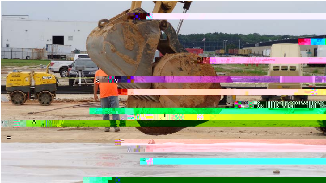
UST #1 extraction