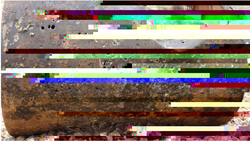
UST # 1 perforations